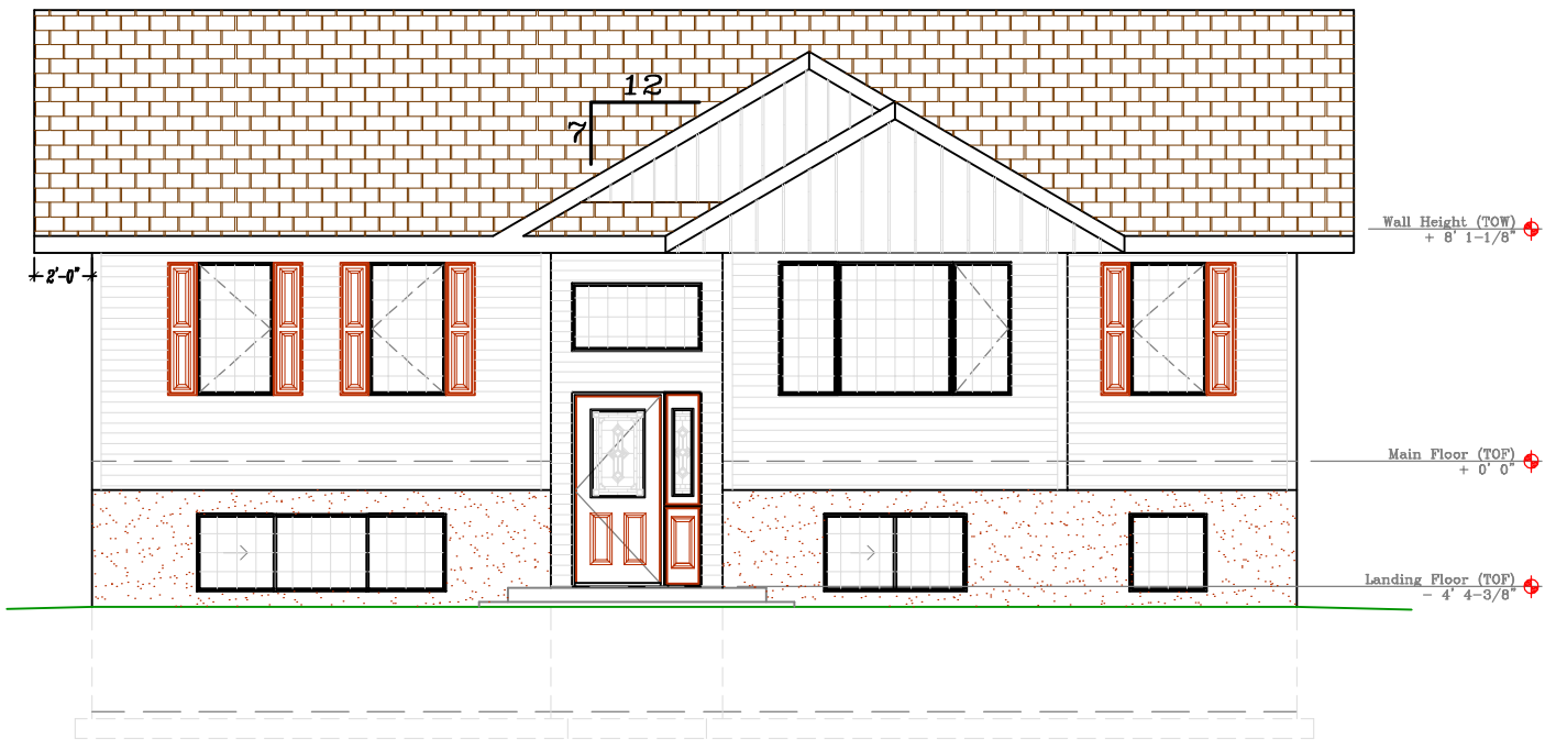
E1 Front Elevation N.T.S.