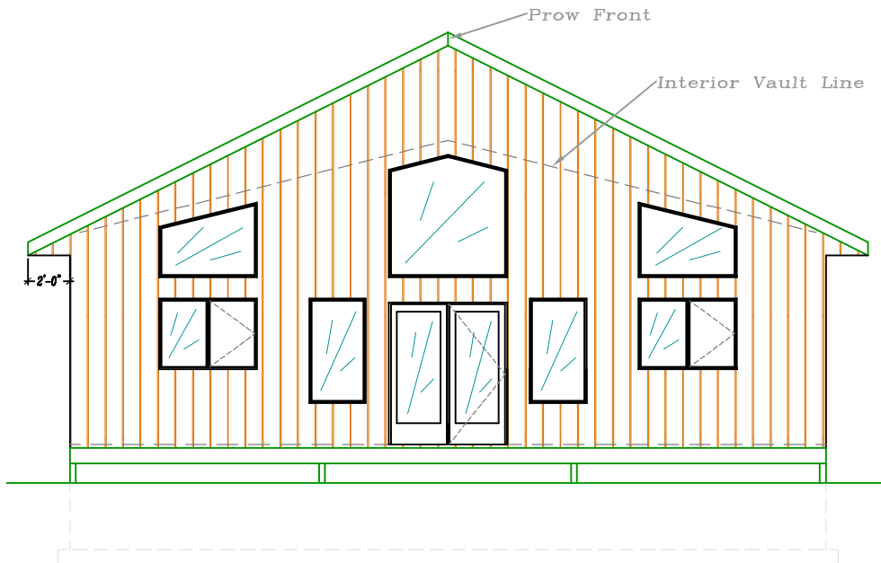
E1 Front Elevation N.T.S.