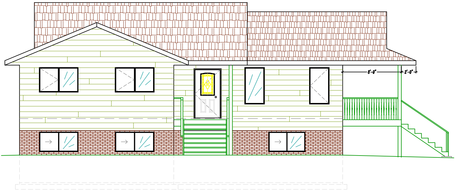
E1 Front Elevation N.T.S.